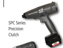
SPC Series Precision Clutch