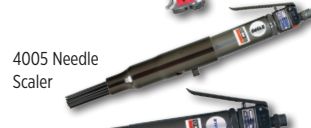
4005 Needle Scaler