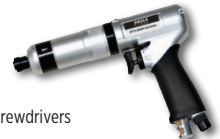
EPTS Series Pneumatic Screwdrivers