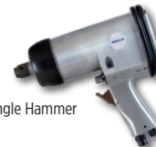
2004 3/4" Single Hammer