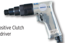
1577 Impact Screwdriver