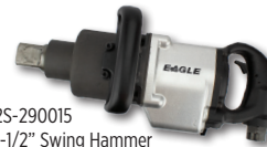
2S-290015 1-1/2" Swing Hammer