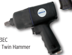
2263EC 1/2" Twin Hammer