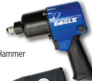
2225 1/2" Twin Hammer