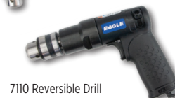
7110 Reversible Drill