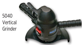
5040 Vertical Grinder