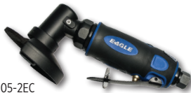
5205-2EC Angle Grinder