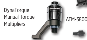
DynaTorque Manual Torque Multipliers