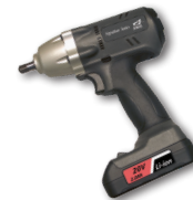
SIW Series Shut-off Impact